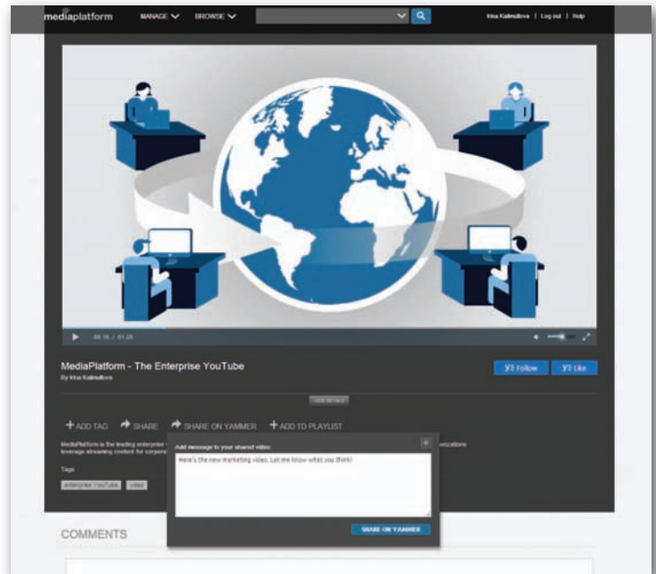
Easily Share Video to Yammer

All social activity connected to videos shared to Yammer is passed to MediaPlatform. Employees also have the option to engage on the MediaPlatform page - like, reply or view conversations. In addition, comments made in MediaPlatform are posted to Yammer and can be shared with all colleagues, a group or an individual team member.