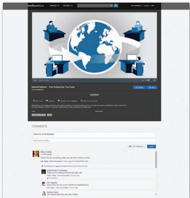
Yammer Feed in MediaPlatform